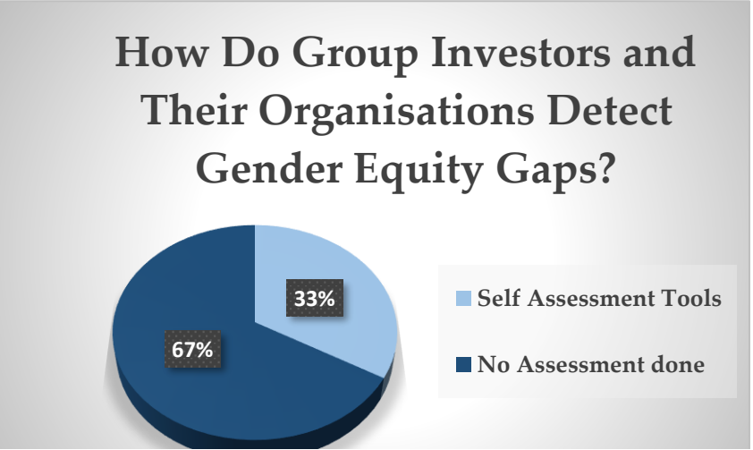
Besides affecting founders, the outcome of Figure 2 - How do Group Investors and Their Organizations Detect Gender Equity Gaps?

Nonetheless, the belief in balance, in the equality of men and women-led businesses, and the complementarity of diverse teams